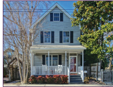
318 Chestnut Street - $860,000