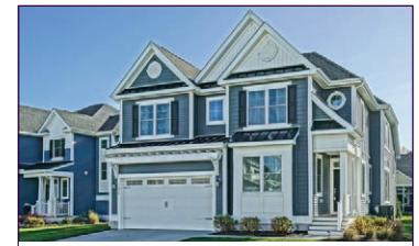
11838 Haslet Road Governors $965,900