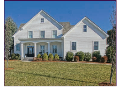
35807 Black Marlin Drive - $1,375,000