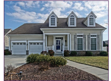
321 Lightship Ln - $854,500