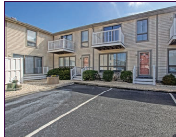
215 Cedar Street #4, $525,000