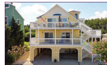
5 Sandpiper Court $1,500,000