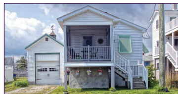
100 Cedar St #1 Lewes Beach $673,245