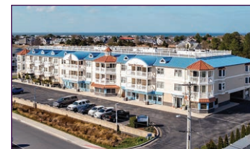
110 Anglers Road #201 $749,900