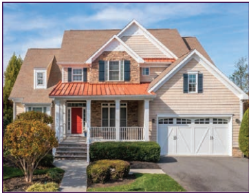
33517 West Hunters Run - $825,000