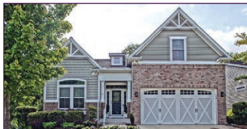
103 Samantha Drive Canary Creek $875,000