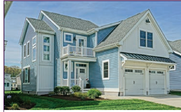
11520 Maul Road Governors $1,099,999