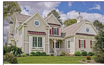
31850 Shell Landing Way Lewes $1,039,900