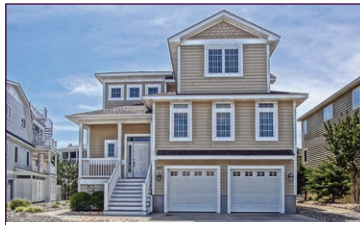
307 W. Cape Shores Drive Cape Shores $1,869,900