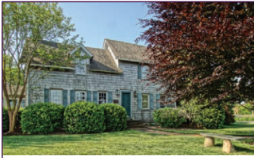
300 Gills Neck Road Lewes $2,200,000