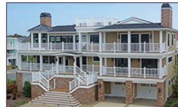
121 Breakwater Reach $3,250,000