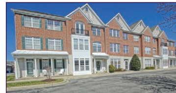
33184 Denton Street Villages of Five Points-West $699,900