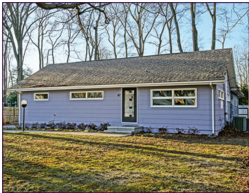
47 Sussex Street - $650,000