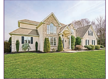
14 Bridal Ridge Circle - $1,100,000