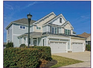
35192 Pilot Boat Drive - $705,000