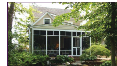
140 Kings Highway $1,250,000