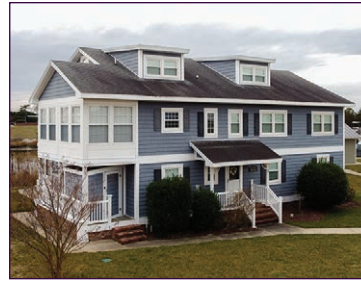
2 Ch Mason Way - $3,150,000