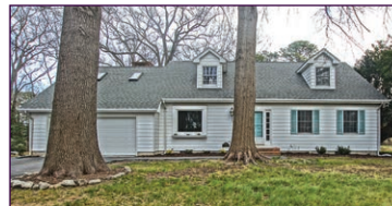
120 E Wild Rabbit Run Covey Creek $709,900