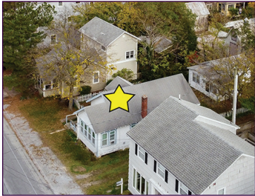
205 Midland Avenue - $950,000