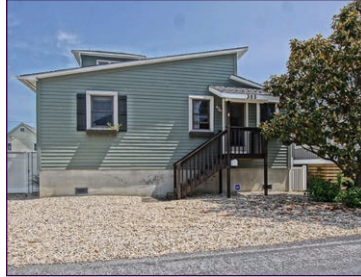
305 Midland Avenue - $1,210,000