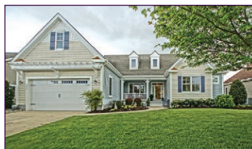
16615 Shoal Road $819,900