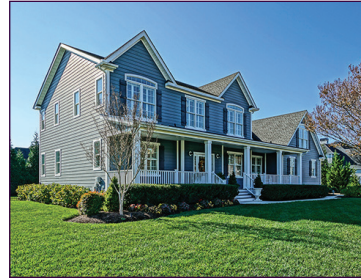
37516 Golden Eagle Blvd. - $1,395,000