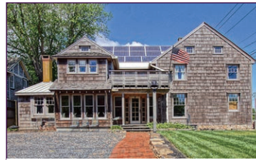
304 Pilottown Road Downtown Lewes $1,799,900