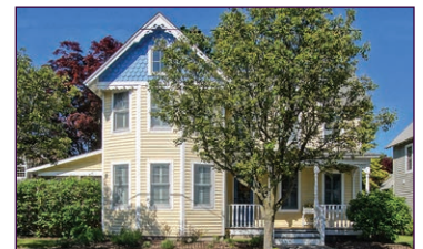
119 Dewey Avenue Downtown Lewes $1,650,000