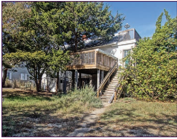
804 Bay Avenue $4,375,000