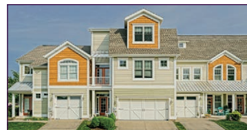
35065 Zwaaneadael Ave. Breakwater $649,900