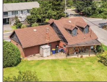
209 Cedar Street - $1,100,000