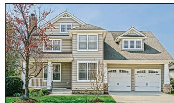
17171 Exton Street $750,000