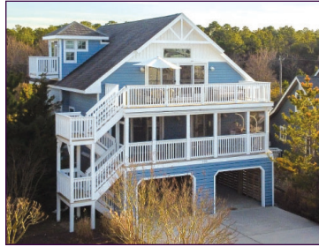
122 Henlopen Shores Circle - $1,499,900