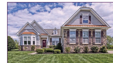
18233 Seagrass Court $649,900