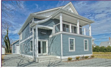
106 New Road Downtown Lewes $1,270,000