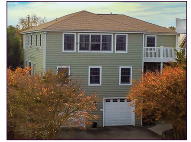
8 Lighthouse Way - $1,666,000