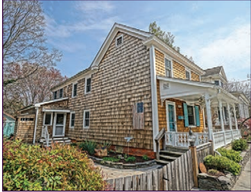
113 E 4th Street - $1,325,000