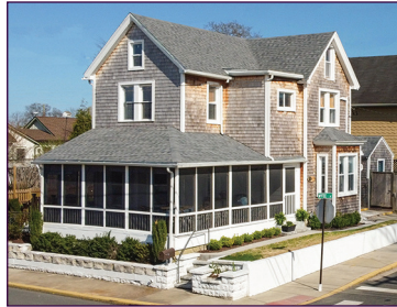
713 Savannah Road - $899,900