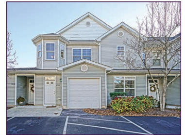
34677 Villa Circle #502 - $365,000