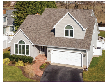
12 Bay Breeze Drive - $759,900