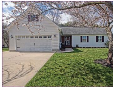
21 Sandpiper Drive - $599,900