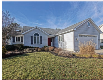
228 Ocean View Blvd - $799,900