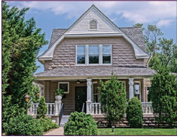
115 Kings Highway $1,500,000