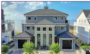
110 Breakwater Reach $3,999,999