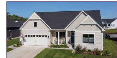
32141 Heritage Road Lewes $599,900