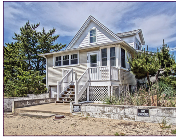
1408 Bay Avenue - $3,600,000