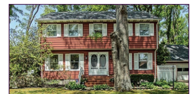
49 Sussex Drive Lewes $699,000