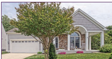
34951 Compass Cove Bay Crossing $699,900